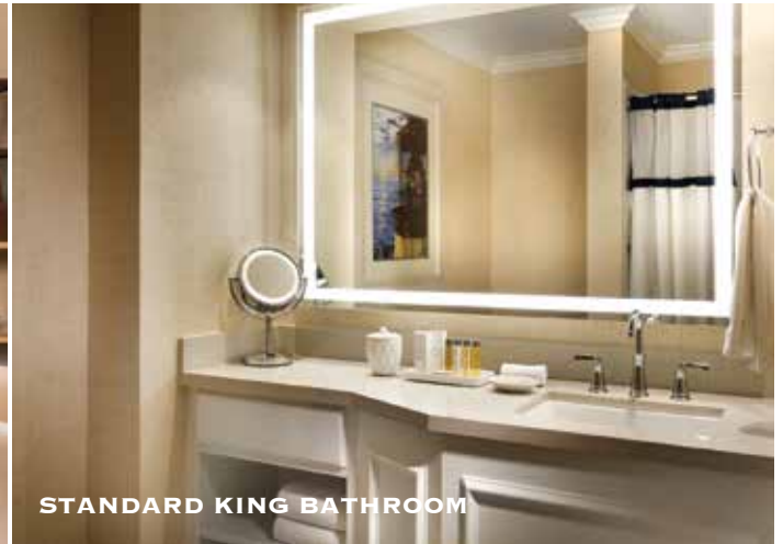
STANDARD KING BATHROOM