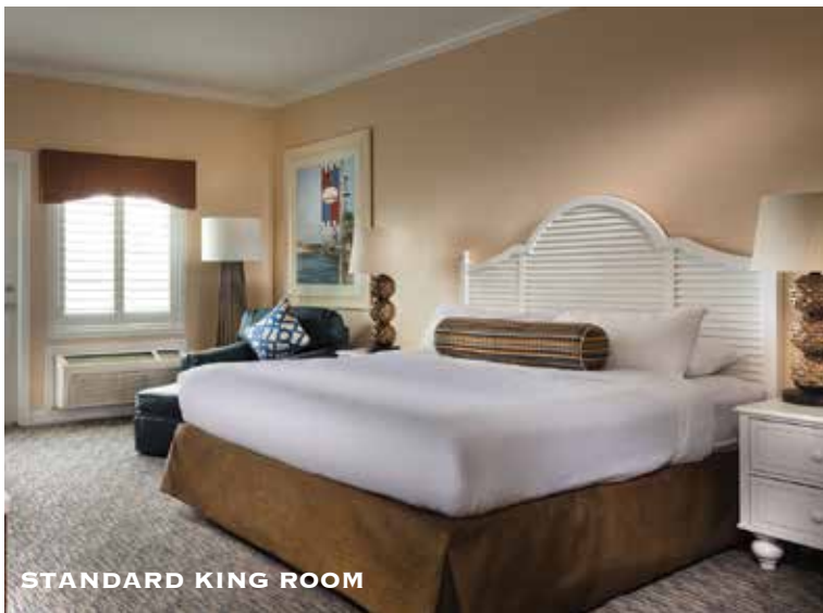
STANDARD KING ROOM