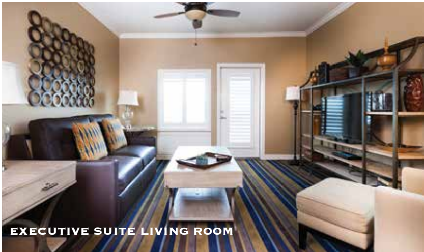
EXECUTIVE SUITE LIVING ROOM