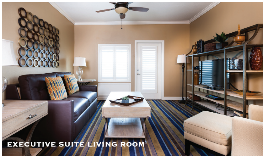
EXECUTIVE SUITE LIVING ROOM