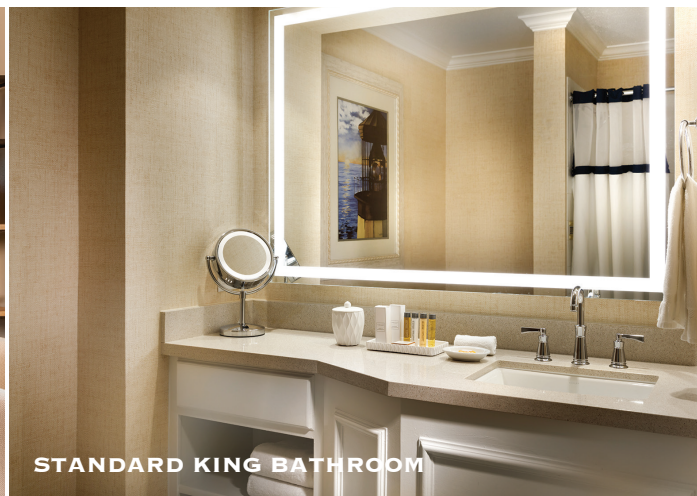
STANDARD KING BATHROOM