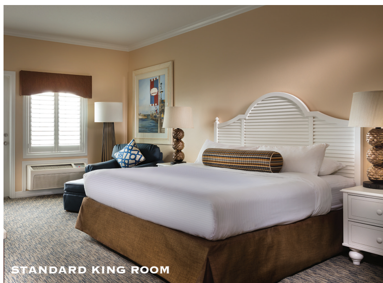
STANDARD KING ROOM